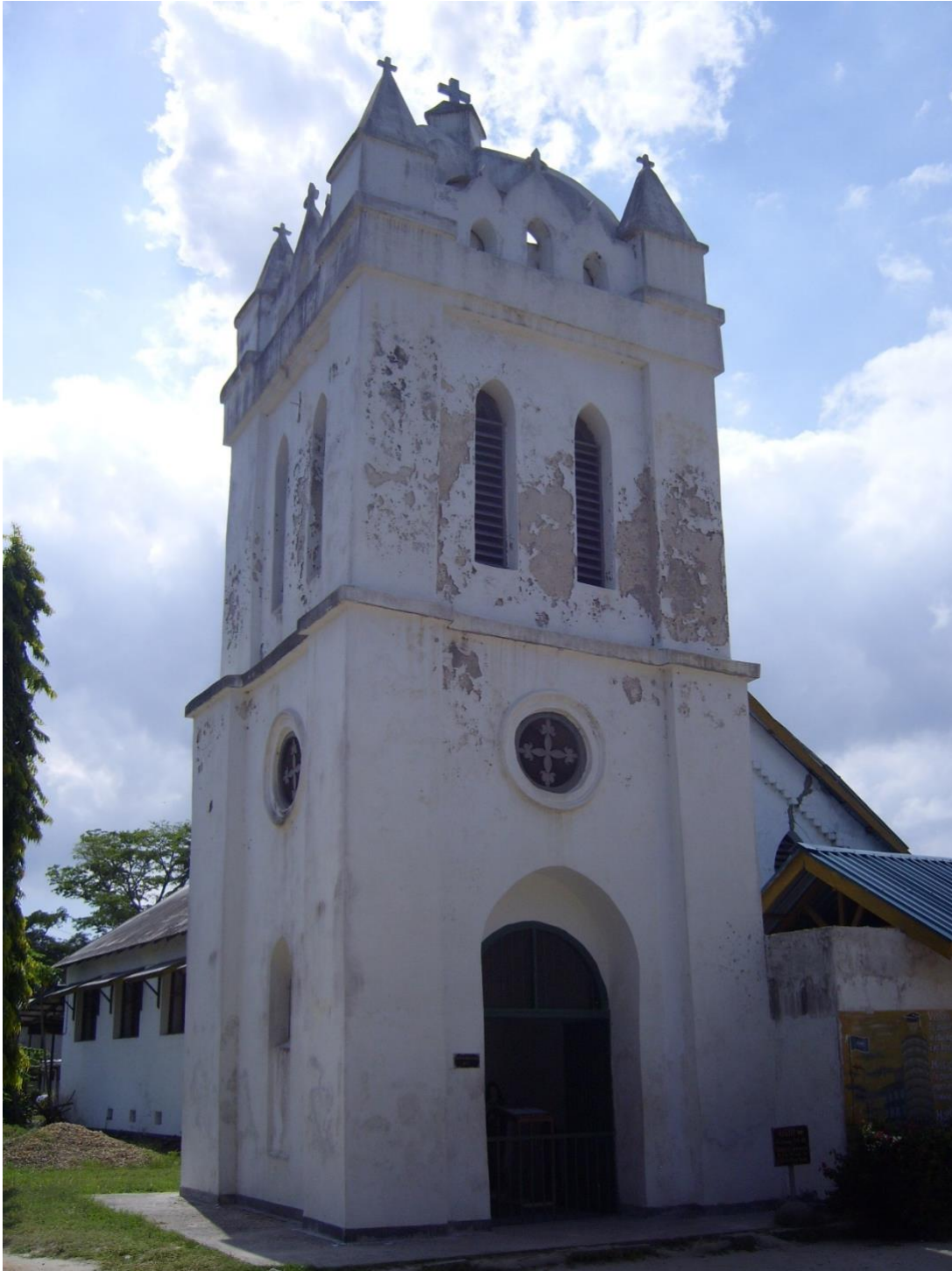
Fig. 4. “Livingstone Tower” in at the Old Holy Ghost Church in Bagamoyo, first built in 1872. Inside the archway is a plaque with an inscription, part of which reads: ‘In this tower the body of the late Dr. David Livingstone was rested for one night from 24 th to 25 th of February 1874 before being transported to London. This tower is also known as Livingstone tower due to the fact that his body was rested here for a while.’ Taken by the author in October 2013.