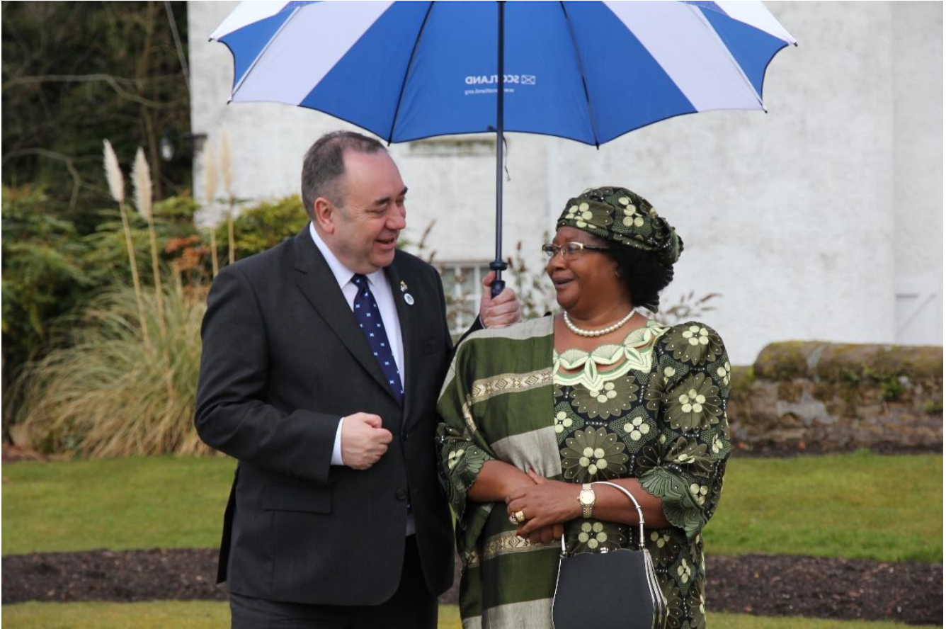
Fig. 6. Dr. Joyce Banda, President of the Republic of Malawi, with Alex Salmond, First Minister of Scotland, in Blantyre, Scotland in 2013.

space to contest narratives about Livingstone that venerate him. The UNESCO applications, which centre a positive image of Livingstone in their construction, are also partly a reflection of this small institutional space.