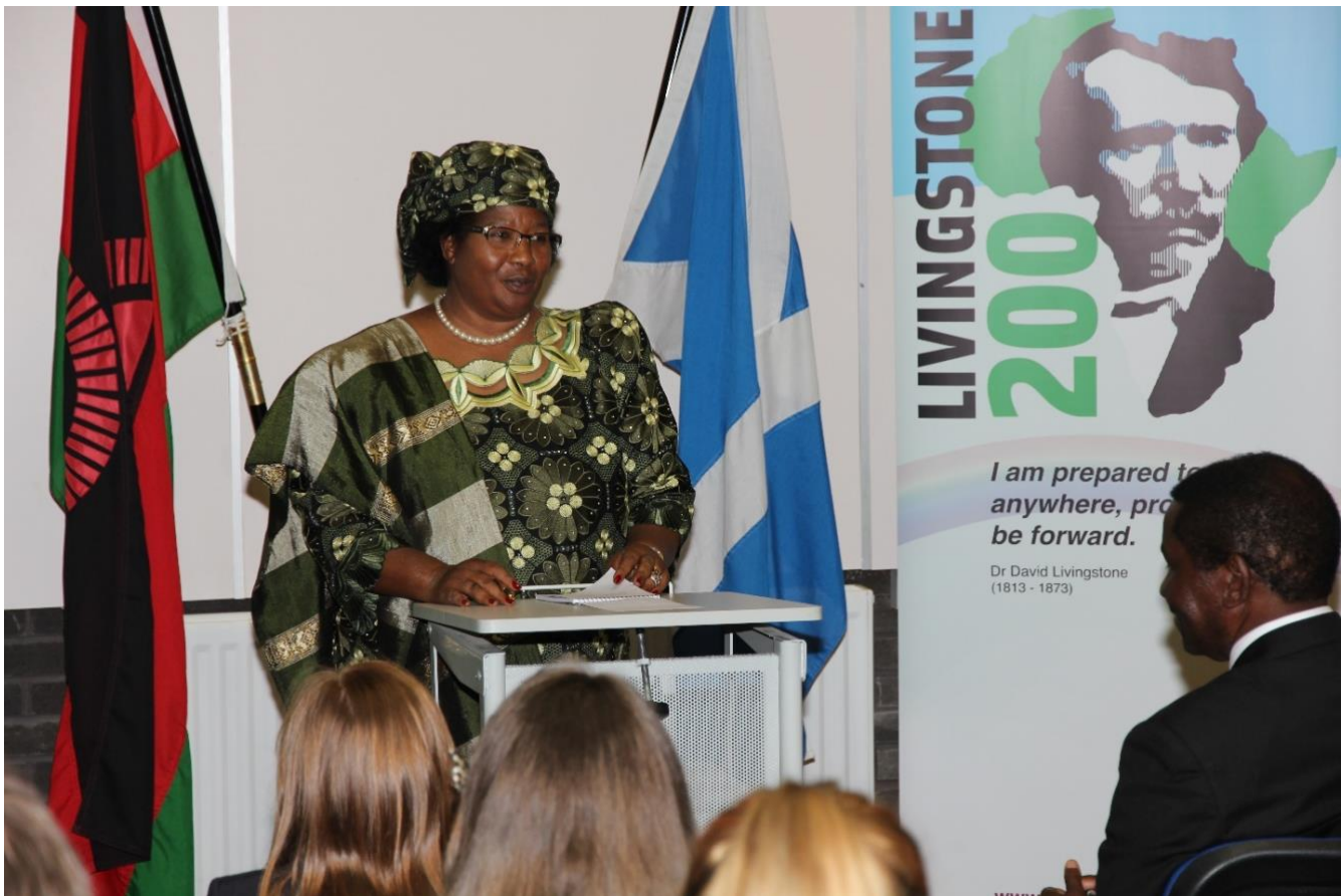
Fig. 7. Dr. Joyce Banda speaking in Blantyre, Scotland during the Livingstone 200 celebrations in 2013.

Malawi. 76 He then went on to describe those of Livingstone’s legacies that he saw as having ‘relevance for Malawi today,’ which included his links to medicine and exploration, as well as his advocacy. 77 As such, he positioned Livingstone and his legacies as crucial to Malawi’s development in the present and future. Thus, if Livingstone was central to an emergent Scottish sense of nationhood in the late nineteenth century, for many – especially Christian – Malawians, he has become central to their own sense of nationhood in the twenty-first. Scotland’s continued projection of Livingstone in its relationship with the wider world further reinforces this trend.