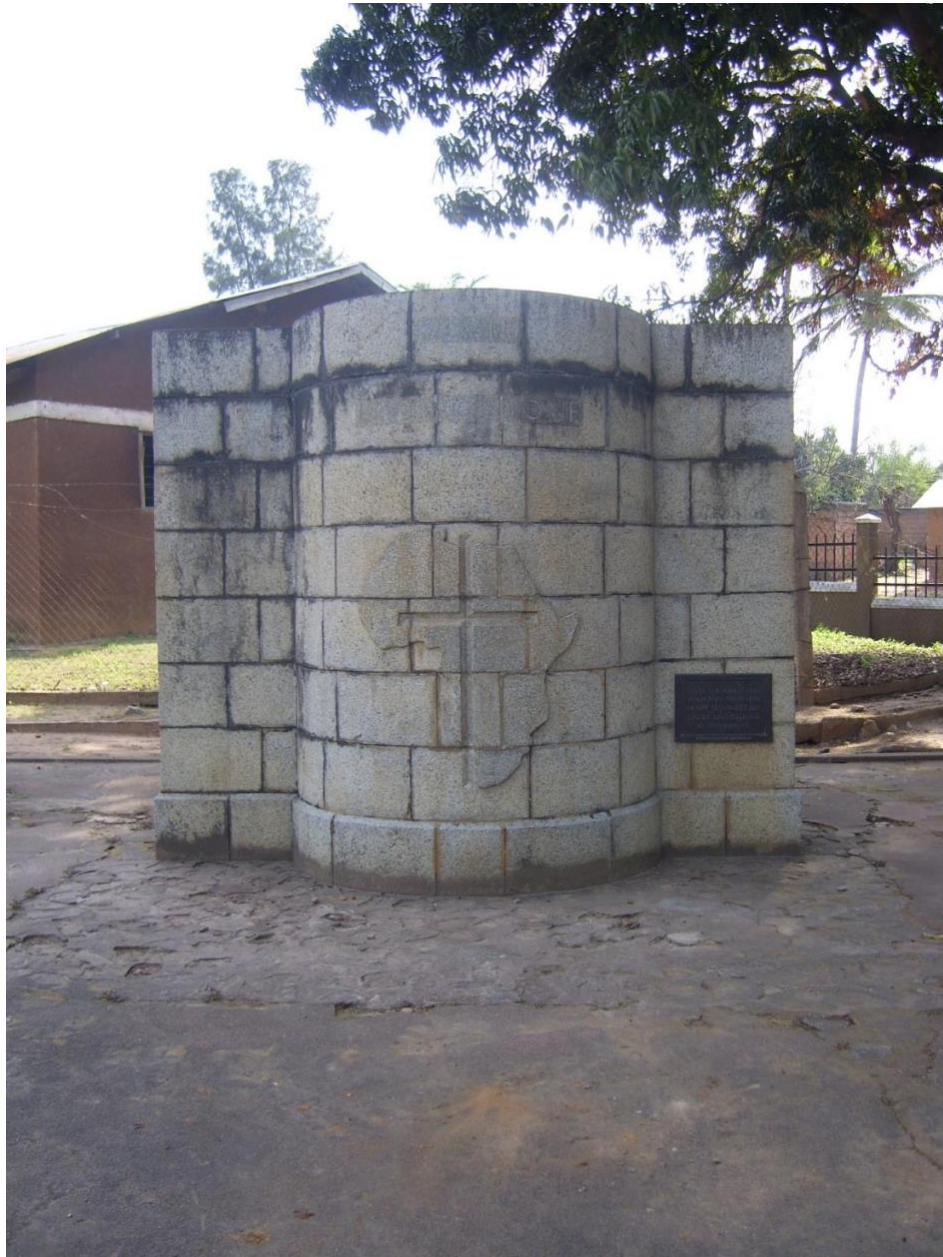
Fig 2. The white plinth at Ujiji's Livingstone Memorial Museum , in front of which Michael Palin made his 'sermon.' The words 'David Livingstone' are faded at the top of the plinth. The plaque on the bottom right reads, 'Under the mango tree which then stood here Henry M. Stanley met David Livingstone, 10 November 1871.' Taken by the author, October 2013.

Livingstone Memorial Museum ). The clip was hardly meant as serious analysis. Nevertheless, it points to a thread that is followed in the remainder of this article. Apart from a vague aesthetic similarity between Scotland's lochs and East Africa's Great Lakes, this article examines how Livingstone's life and legacy show linkages between Scottish and western IOW conceptions of nationhood, past and present.