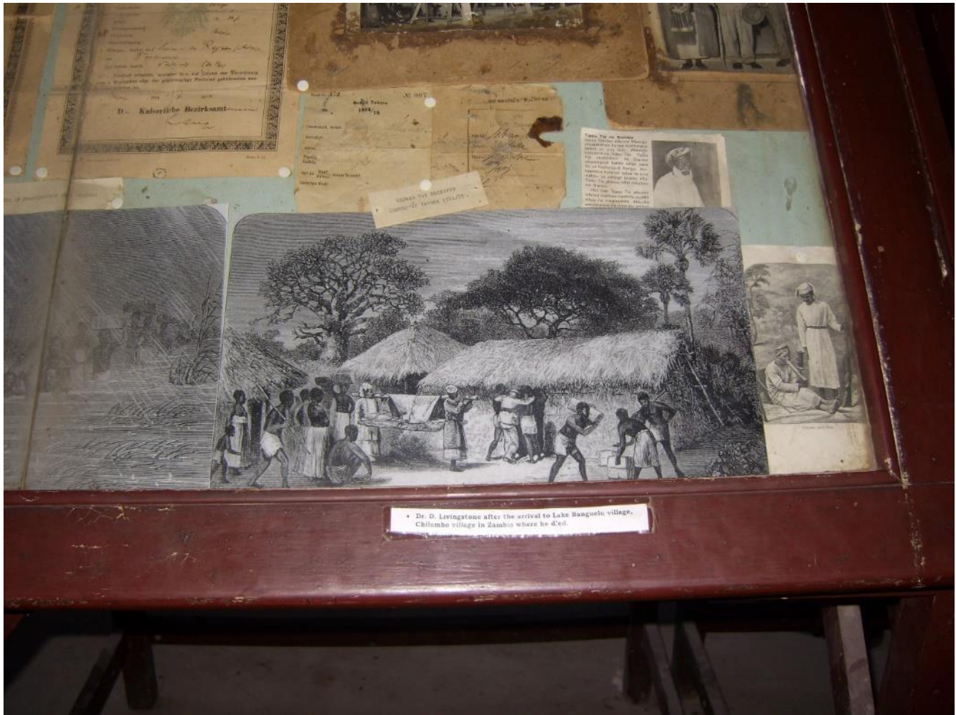
Fig 3. Section of a display in Livingstone's Tembe in Kwihara, near Tabora. The image is an artistic impression of Livingstone's arrival in present-day Chipundu, where he died, in 1873.

almost certainly reflected imperial expectations as much as past realities). 45 The dimensions and its purpose as a site commemorating Livingstone have remained constant ever since. 46