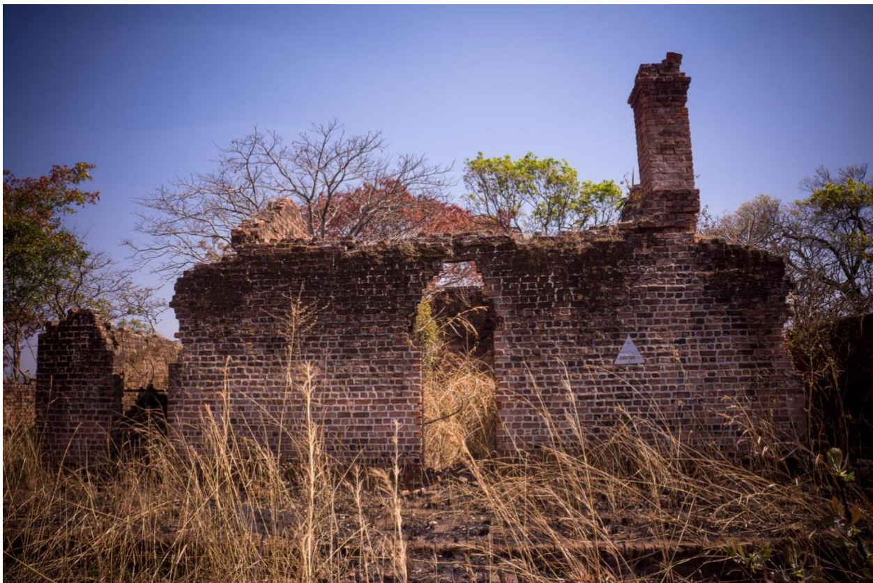
Fig. 5. Guardroom and armoury inside Fort Manochi. By Tim Cowley - Own work, CC BY-SA 4.0, https://commons.wikimedia.org/w/index.php?curid=36429112 [Uploaded: 1 Oct. 2014; accessed: 21 Sep. 2021]

Museums and individual sites of commemoration for Livingstone are less prominent in Malawi's application than they are in Tanzania's. Malawi's application instead focuses on old buildings, many of which are in ruins, such as Forts Mangochi and Lister. Both these forts were built in the early colonial era for the purposes of combatting the slave trade and colonial administration. Livingstone is seen as central to the earlier history, as evidenced from his position in the application's title. He is portrayed as a witness to the slave trade and as someone who attempted to stop it. In Nkhotakota, for example, he is credited with negotiating a treaty between Chief Jumbe and nearby Chewa chiefs 'to stop [the] slave trade and hostilities.' 51 Even though Jumbe and the chiefs soon reneged on these alleged promises (Livingstone's account is the only one we have of them), Livingstone is portrayed as an early anti-slavery 'hero' in Malawian history. His actions are then seen to have provided the ideological basis on which colonial rulers ended the slave trade.